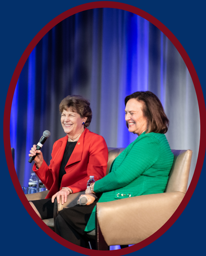
Deb Fisher & Jeanne Shaheen