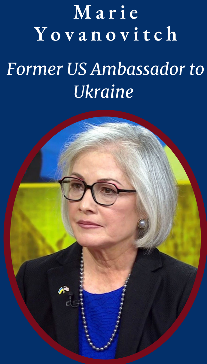
Marie Yovanovitch Former US Ambassador to Ukraine