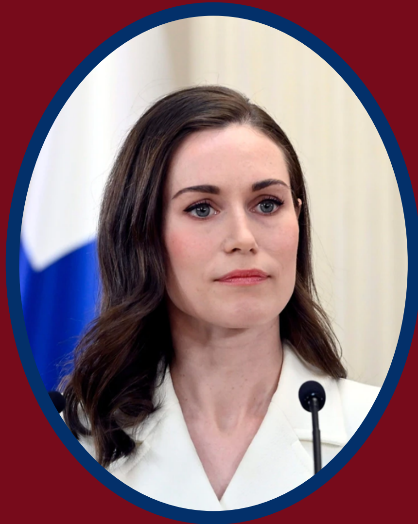
Sanna Marin, Prime Minister of Finland Youngest woman Prime Minister in the world and initiator of Finland's decision to join NATO.