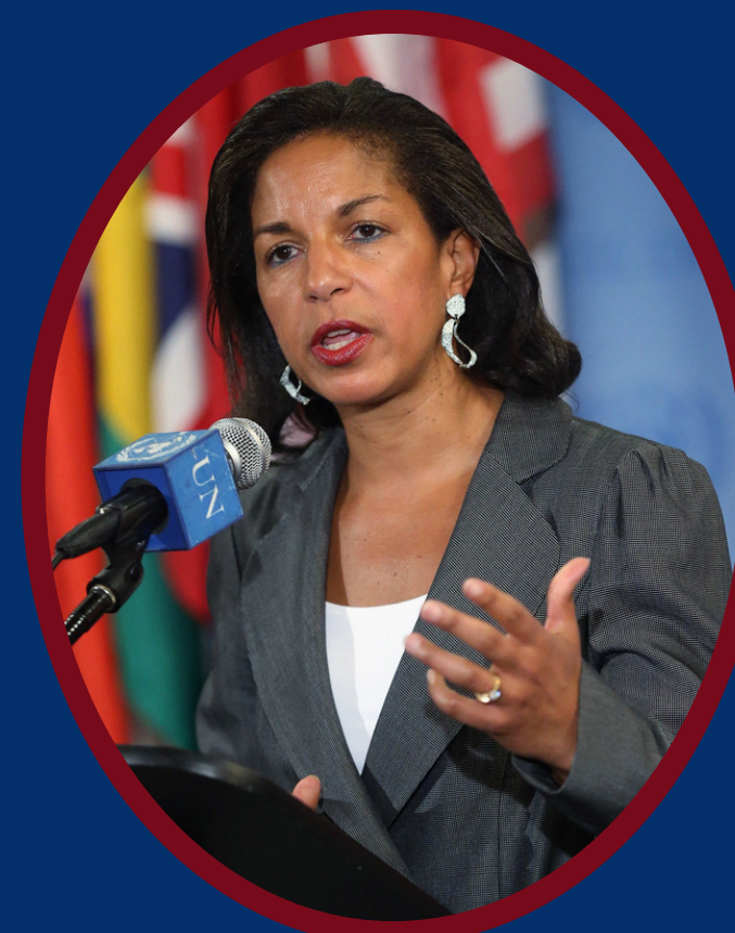
Susan Rice Former National Security Advisor