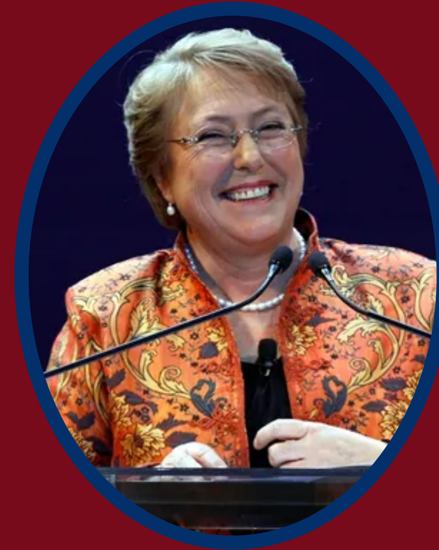
Michelle Bachelet, former President of Chile First woman President of Chile and former UN High Commissioner for Human Rights.