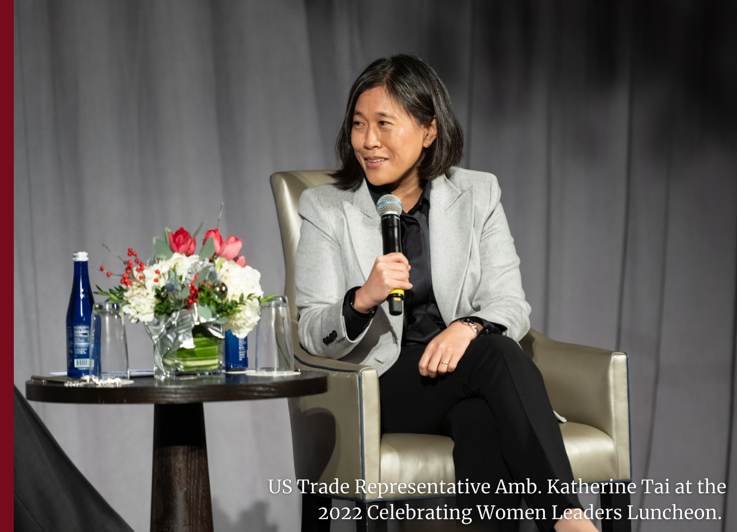
US Trade Representative Amb. Katherine Tai at the 2022 Celebrating Women Leaders Luncheon.

WFPG is an independent 501(c)(3) nonprofit organization (EIN 52-1818839).