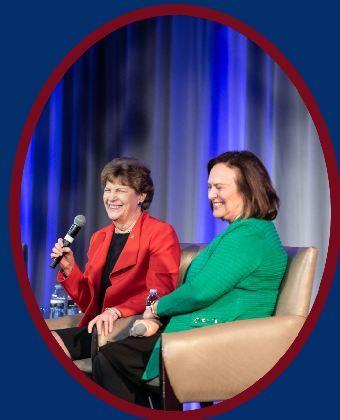
Deb Fisher & Jeanne Shaheen US Senators