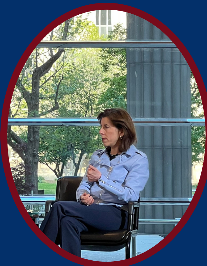
Gina Raimondo US Secretary of Commerce