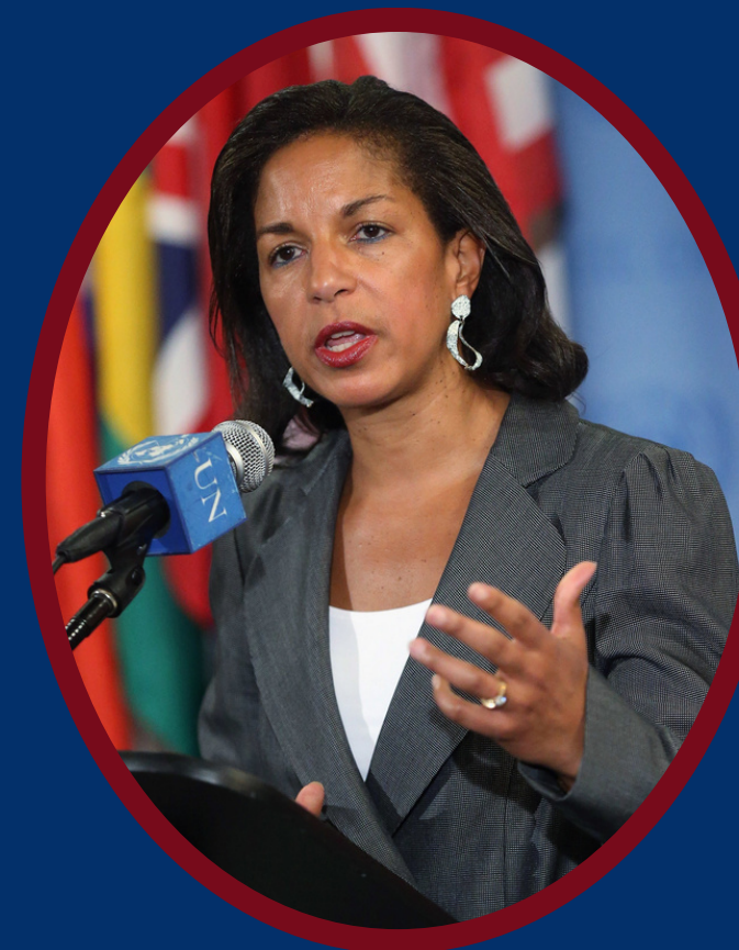
Susan Rice Former National Security Advisor