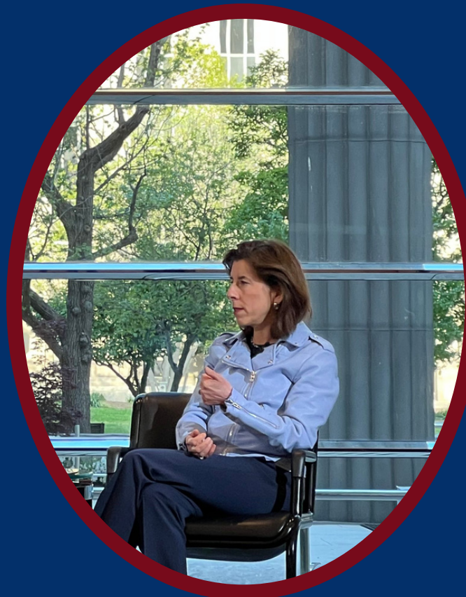
Gina Raimondo US Secretary of Commerce