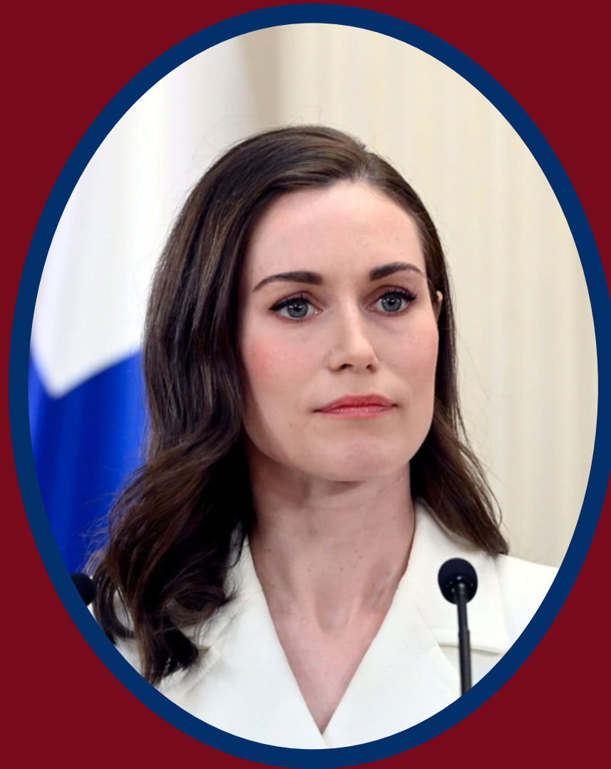
Sanna Marin, Prime Minister of Finland Youngest woman Prime Minister in the world and initiator of Finland's decision to join NATO.