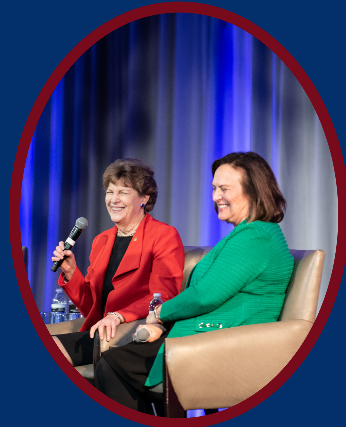
Deb Fisher & Jeanne Shaheen US Senators