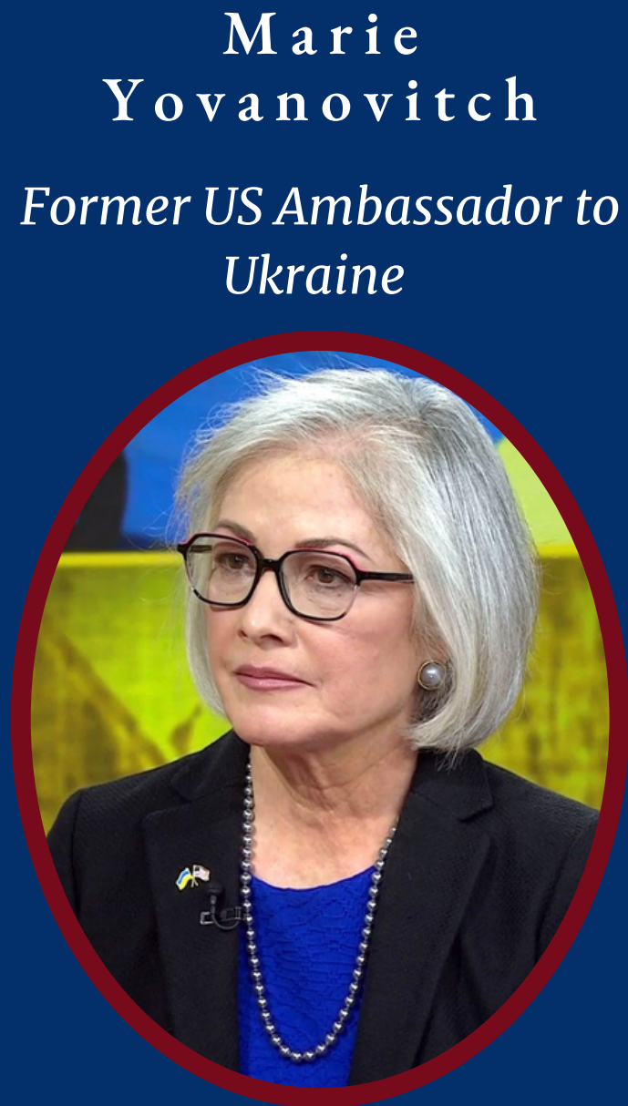
Marie Yovanovitch Former US Ambassador to Ukraine