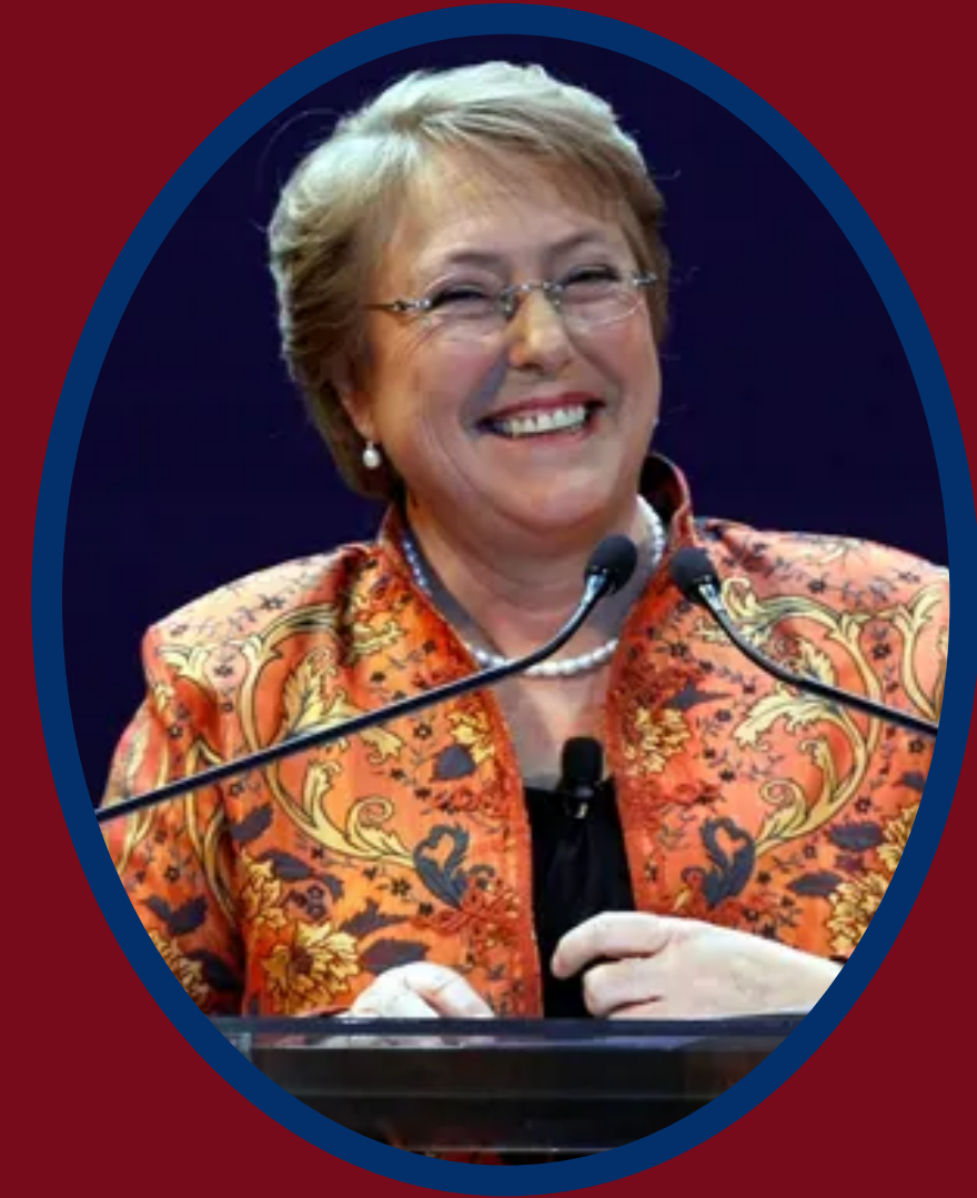
Michelle Bachelet, former President of Chile First woman President of Chile and former UN High Commissioner for Human Rights.